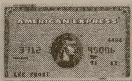
Membership Has Its Privileges®

So get the Card. And get ready to cover new territory on either side of our Great Continental Divide.