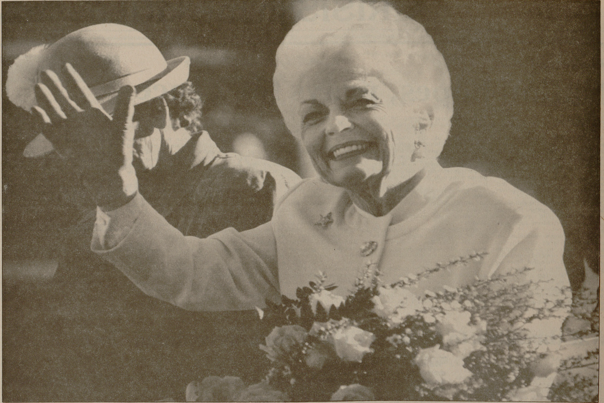
Governor Ann Richards waves to spectators during the Inaugural Parade on Congress Avenue in Austin.