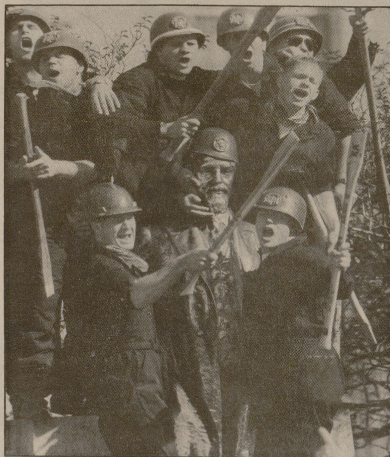
Senior bonfire redpots stir up the crowd before leading them around campus to the bonfire site.