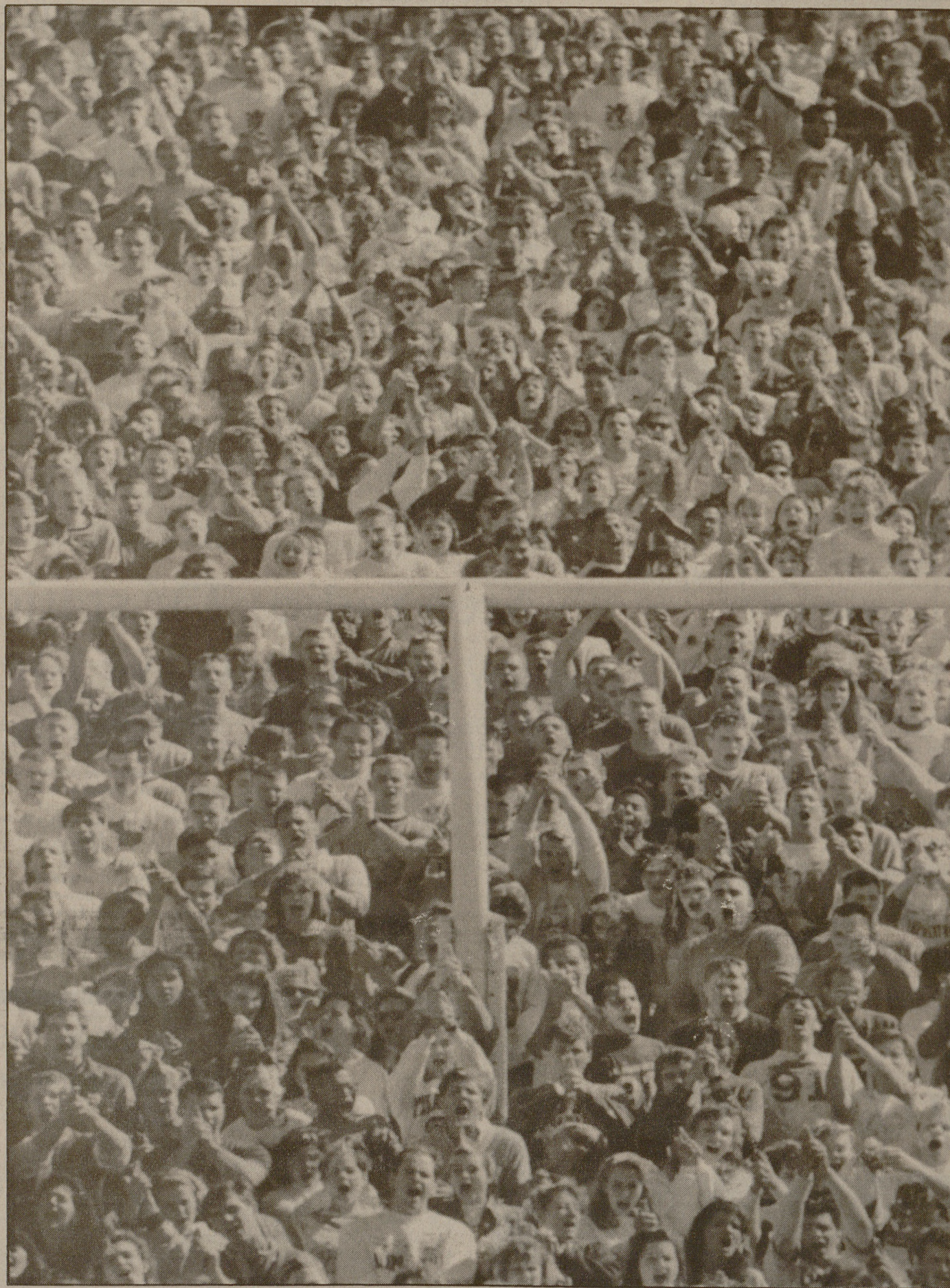
The Class of '91 whoops it up during a yell practice held at the north end of Kyle Field. Afterward, the mass of people was led through the quad. Every year, before bonfire, seniors gather in front of the Sul Ross statue and wander around campus like elephants looking for a place to die. Elephant Walk is one of the many traditions at Texas A&M which unifies the class and enhances the school spirit.