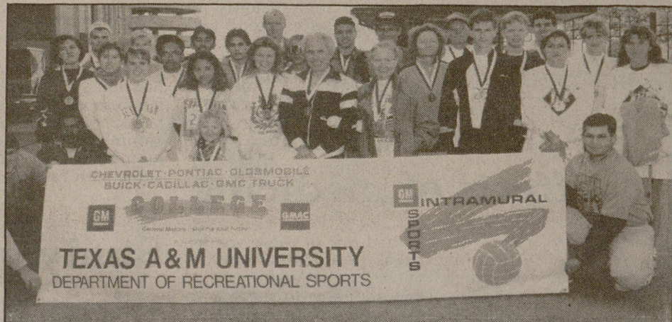
Pictured above are the winners of each age group of the Kyle Field Ramp Romp II