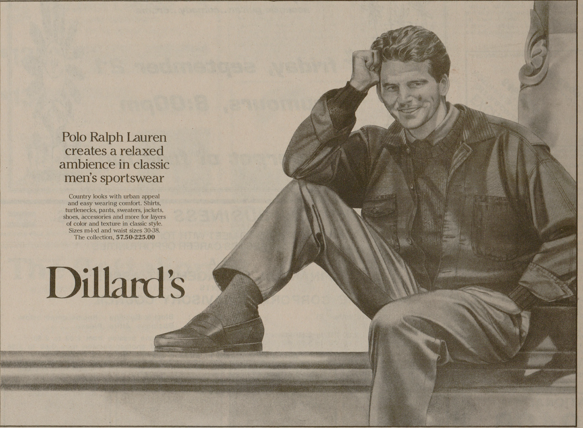
SHOP DILLARD'S MONDAY THROUGH SATURDAY 10-9; SUNDAY 12-6; POST OAK MALL, HARVEY ROAD AT HIGHWAY 6 BYPASS, COLLEGE STATION. MASTERCARD, VISA, DINERS CLUB, CARTE BLANCHE, AMERICAN EXPRESS, DISCOVER AND DILLARD'S CHARGE CARDS WELCOME.

"If not allowing the 24-hour tation policy in A&M halls pre only one rape, it will all be woll Chambers says.