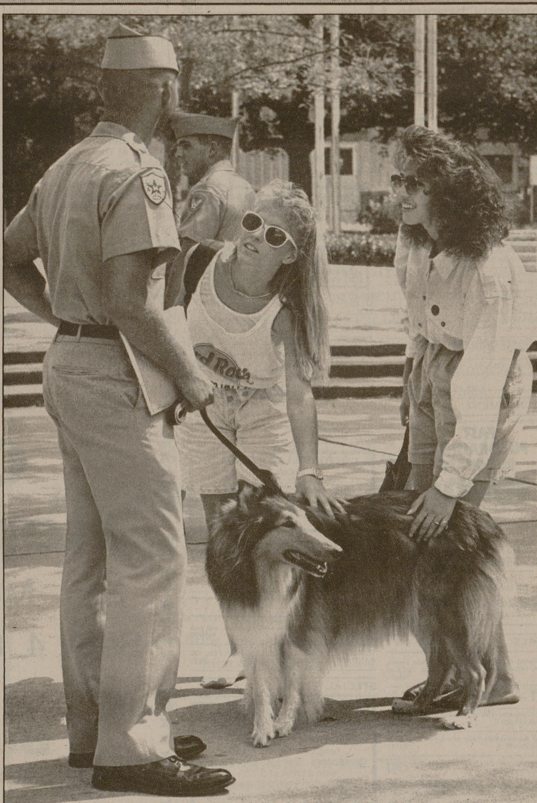
When the two are together, Reville V is not the only focus of attention around campus.