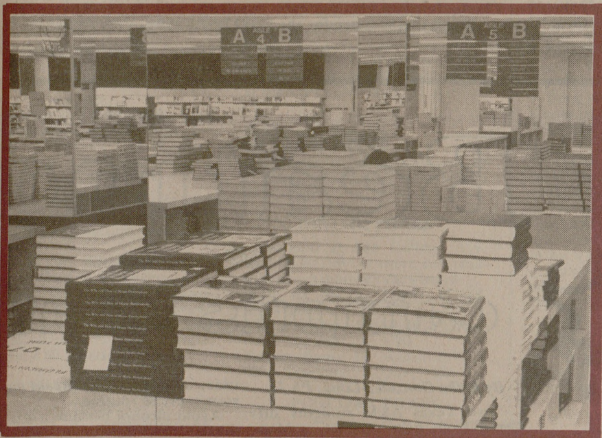
ALL THE BOOKS...ALL THE TIME