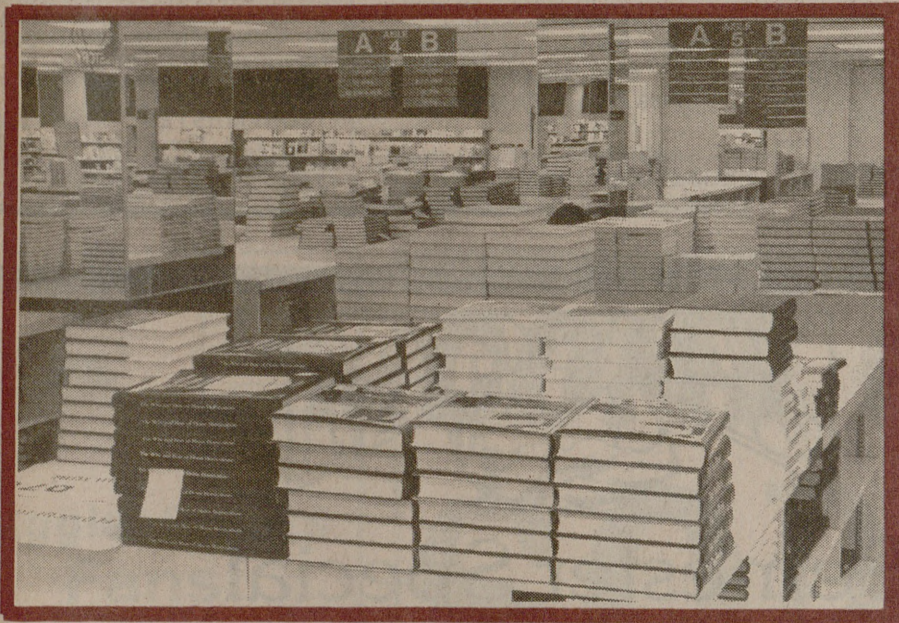
ALL THE BOOKS...ALL THE TIME