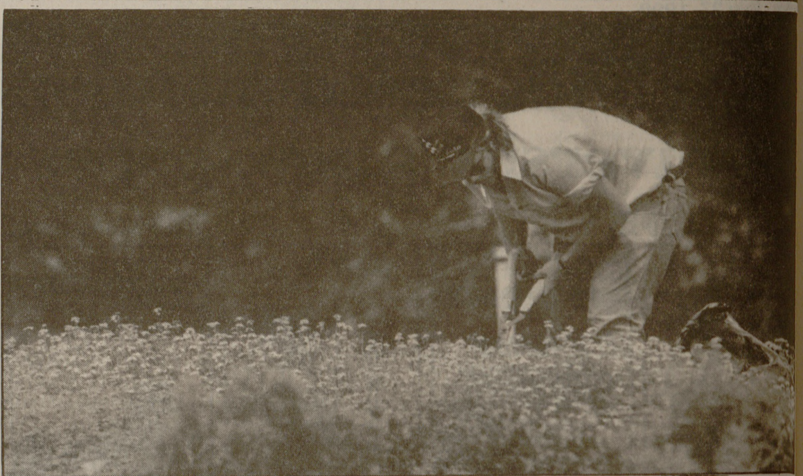
Victor Clark, of the Grounds Maintenance Dept., trims the purple-flowering plant, verbena.