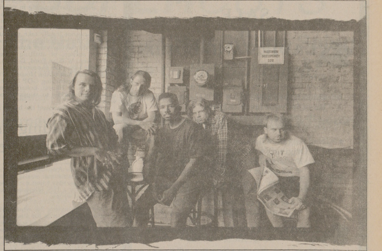
Battalion File Photo