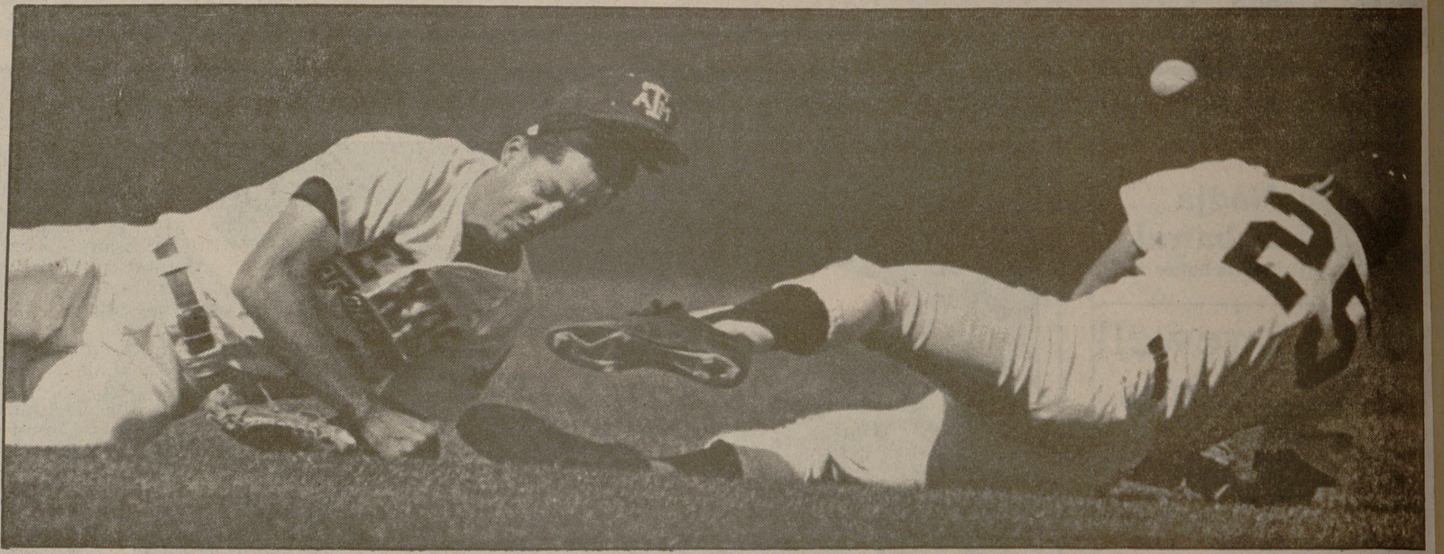
Battalion file photo by S. Weaver