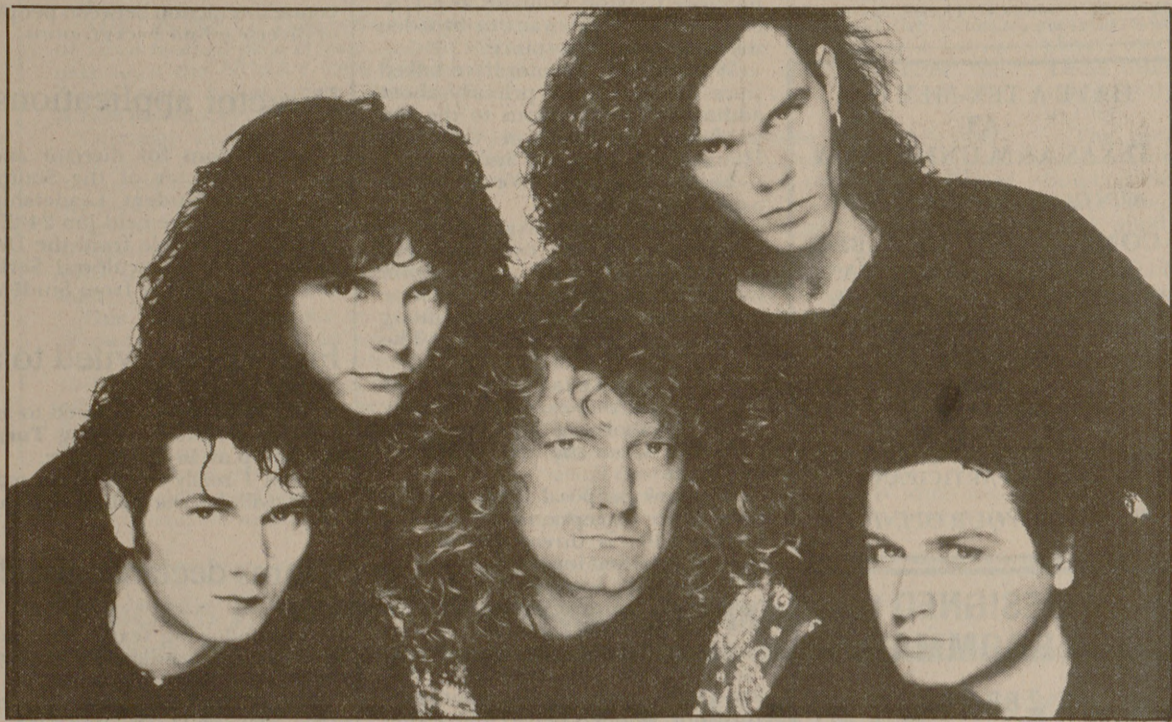
Robert Plant (center) goes a second round with his band on Manic Nirvana . Left to right: guitarist

But then again, all of Plant's solo albums have shined brightly. He first came out with Pictures At