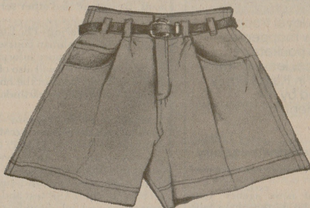
25.00 Palmetto's® baggy western shorts. Indigo fades into soft comfort with belted denim shorts in traditional western style. Acid-washed cotton in sizes 3-13, only 25.00