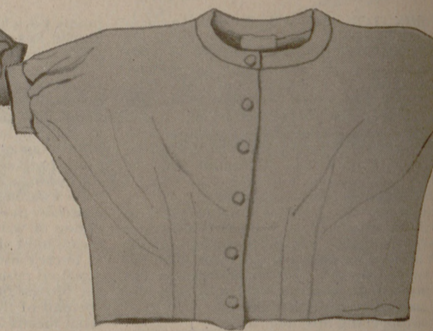
14.00 Croquet Club crop top. Go short and sassy in a button front crop top with crew neck. In fun colors, including hot pink, lime, purple, red, navy, coral, black and white. Sizes s-m-l, 14.00