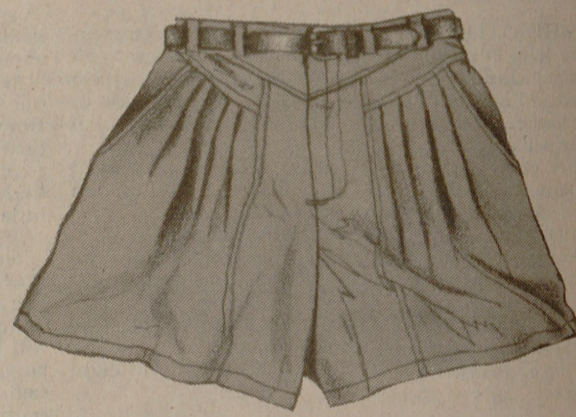
20.00 In-Force walking shorts. Swing out in comfortable cotton twill. A V-yoke, pleated style in navy, basil, khaki and red. Sizes s-m-l, 20.00