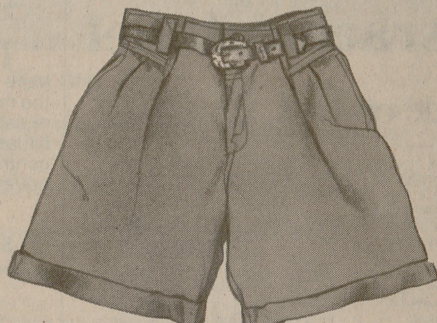
25.00 No Problem split yoke shorts. Classic cotton denim adapts to contemporary fashion. In acidwashed shorts with split yoke, pleats and cuffs. A belted style in sizes 3-13, only 25.00