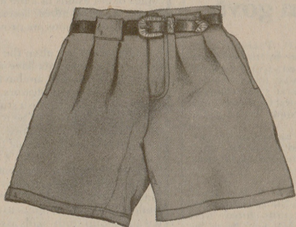
18.00 In-Force box pleat shorts. Follow the fun in belted walking shorts with box pleat front. White, black and camel ramie/cotton in junior sizes s-m-l, 18.00