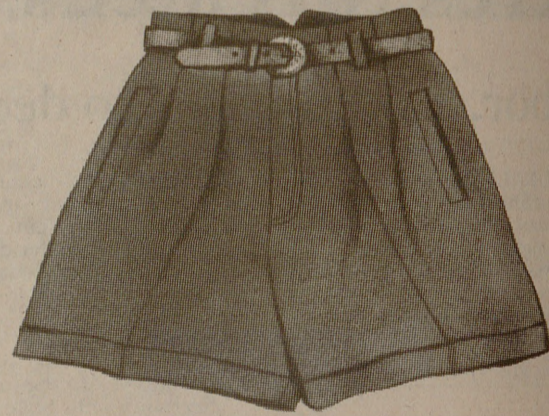
25.00 Palmetto's® hunting shorts. Slip into belted hunting shorts for casual freedom. In acidwashed cotton denim. In sizes 3-13, only 25.00