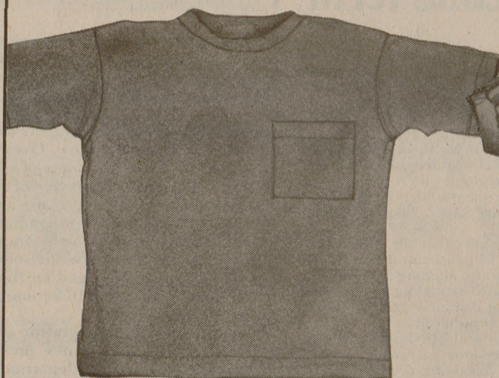
10.00 Single pocket T-shirt. Get in sync with the spring holiday in a tee of soft, cotton interlock. Shoulder pads add an updated touch. White, black, red, purple and gold, sizes s-m-l, 10.00