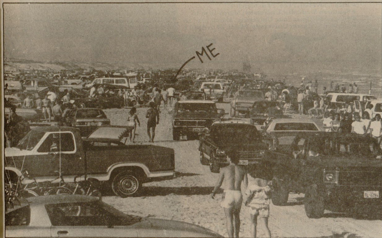
Flavorful Photo Number One