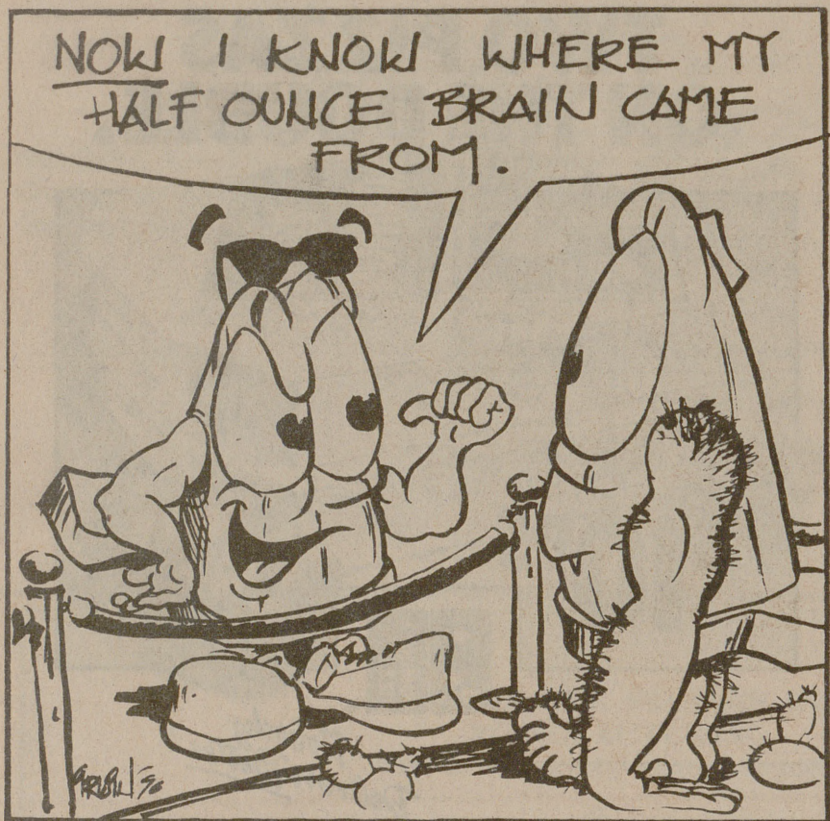
HAT MAN AT THE MUSEUM OF NATURAL HISTORY