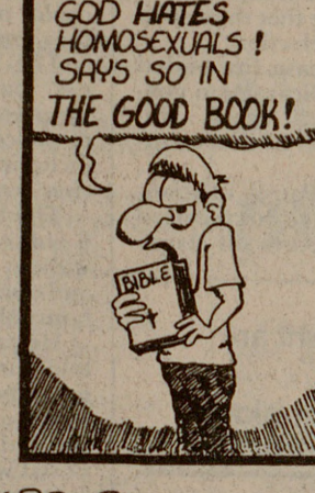
WELCOME BACK TO THE FIRST ANNUAL BIGOT OLYMPICS!" OUR NEXT EVENT IS "BIGOTRY TO-WARDS HOMOSEX-UALS!" UALS!" READY...