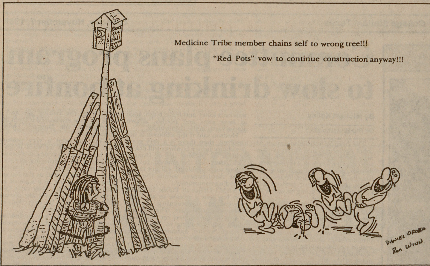
Medicine Tribe member chains self to wrong tree!!! "Red Pots" vow to continue construction anyway!!!