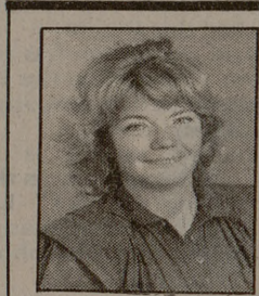
Molly Ivins Syndicated Columnist

People always make such dumb arguments about this, like, "What about Hitler? Think how much better off the world would have been if somebody had assassinated Hitler?" You don't know that: No one does. That's the