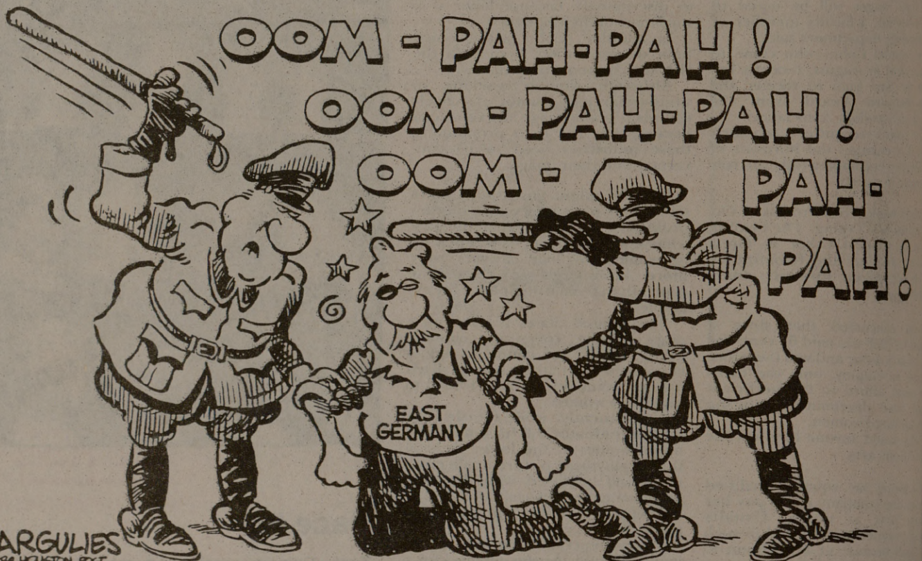
MARGULIES © 1989 HOUSTON POST

Letters to the editor should not exceed 300 words in length. The editorial staff reserves the right to edit letters for style and length, but will make every effort to maintain the author's intent. Each letter must be signed and must include the classification, address and telephone number of the writer.