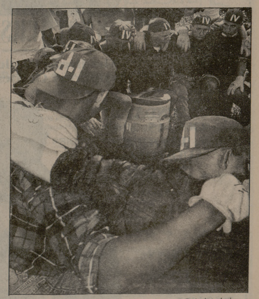
Freshmen cadets from Company D-1 tell "grode" stories during a break on Sunday afternoon.