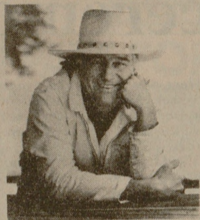
JERRY JEFF WALKER