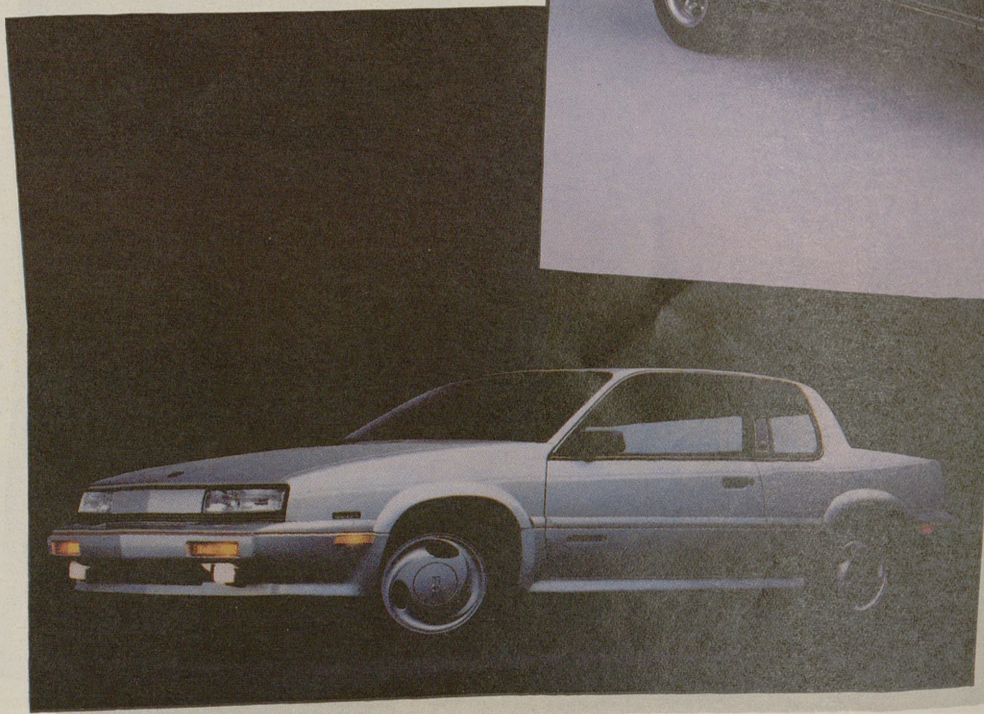
Oldsmobile Calais International Series Coupe

GMAC OFFICIAL SPONSOR OF AMERICA'S DREAMS™