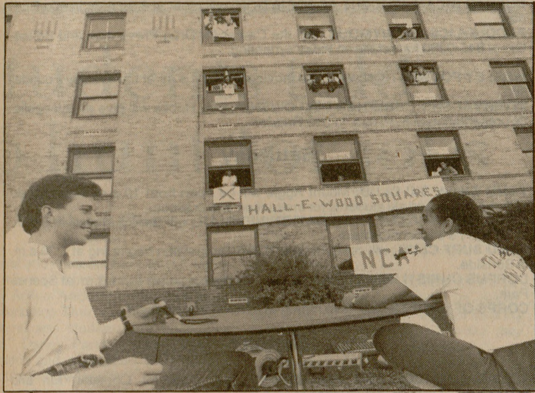
Student leaders participate in Hall-e-wood Squares.