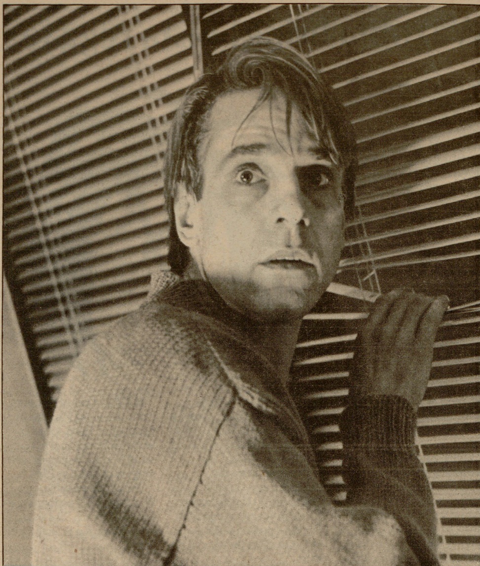
Jeremy Irons plays Dr. Beverly Mantle, whose strange relationship with his twin brother Elliot (also played by Irons) undergoes a terrifying transformation, in David Cronenberg's "Dead Ringers."

"Dead Ringers" Starring Jeremy Irons and Genevieve Bujold Directed by David Cronenberg Rated R ★★½