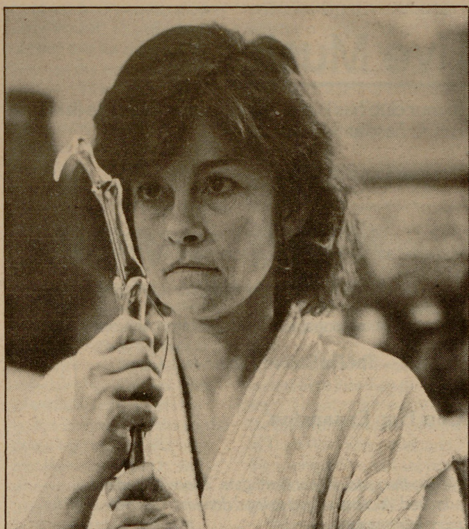
Genevieve Bujold plays Claire, a beautiful actress who causes a change in the unusual relationship of the twin doctors in "Dead Ringers."