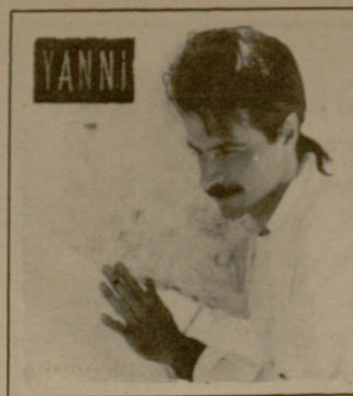
"Chameleon Days" Yanni Private Music ★★★½

Although its earliest recordings date back to the late 1960s and early '70s, the musical style known as new age was mostly unknown until the mid-1980s. Today, many record labels are recording and releasing new age albums.