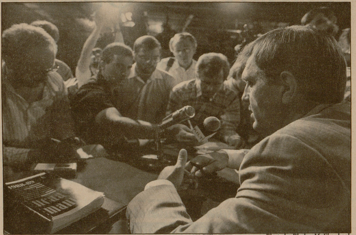
Coach Jackie Sherrill answers questions during a break.