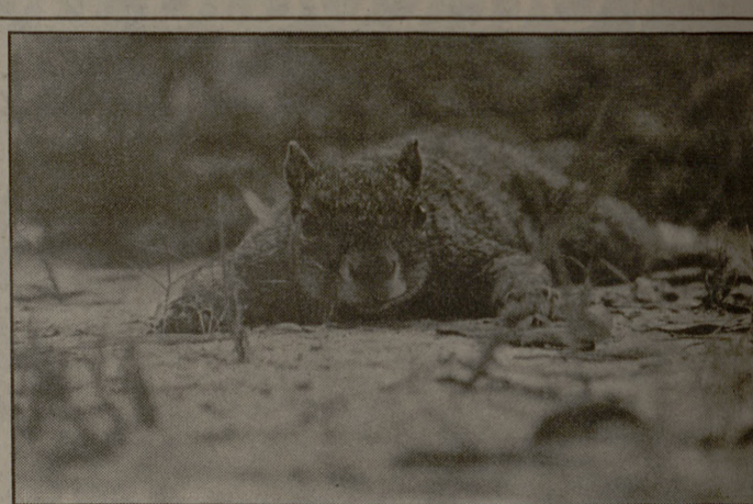
A squirrel attempts to go under cover to attack an unsuspecting passerby.