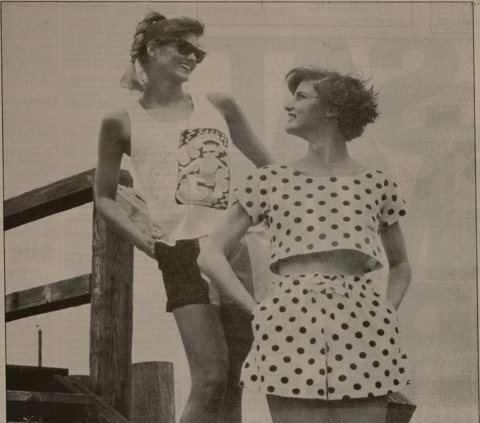
Find all the energetic styling you expect from Ocean Pacific® in this summertime collection of shorts, tanks, cropped tops and screen print tees. Available in an assortment of brights and pastels, cotton and polyester/cotton. Sizes S-M-L. Made in the U.S.A. Reg. 16.00-26.00. In Junior Activewear. Sale ends May 22.

SAVE 25% ON JUNIOR SEPARATES BY OCEAN PACIFIC® 12.-19.50