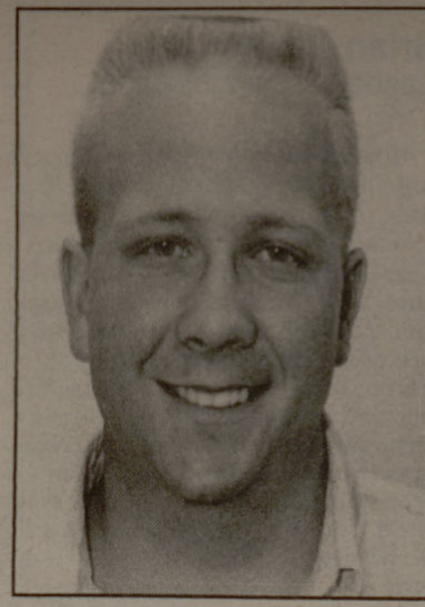
Scott Hart Accounting

Texas A&M is a great institution with time-honored traditions and deep-rooted pride. It is a yell leader's responsibility to uphold the unique image and the bond that sets us apart from all universities. I would be honored to represent the Twelfth Man as a senior yell leader and would take great pride in leading A&M to another victorious year in every respect! Gig'em!