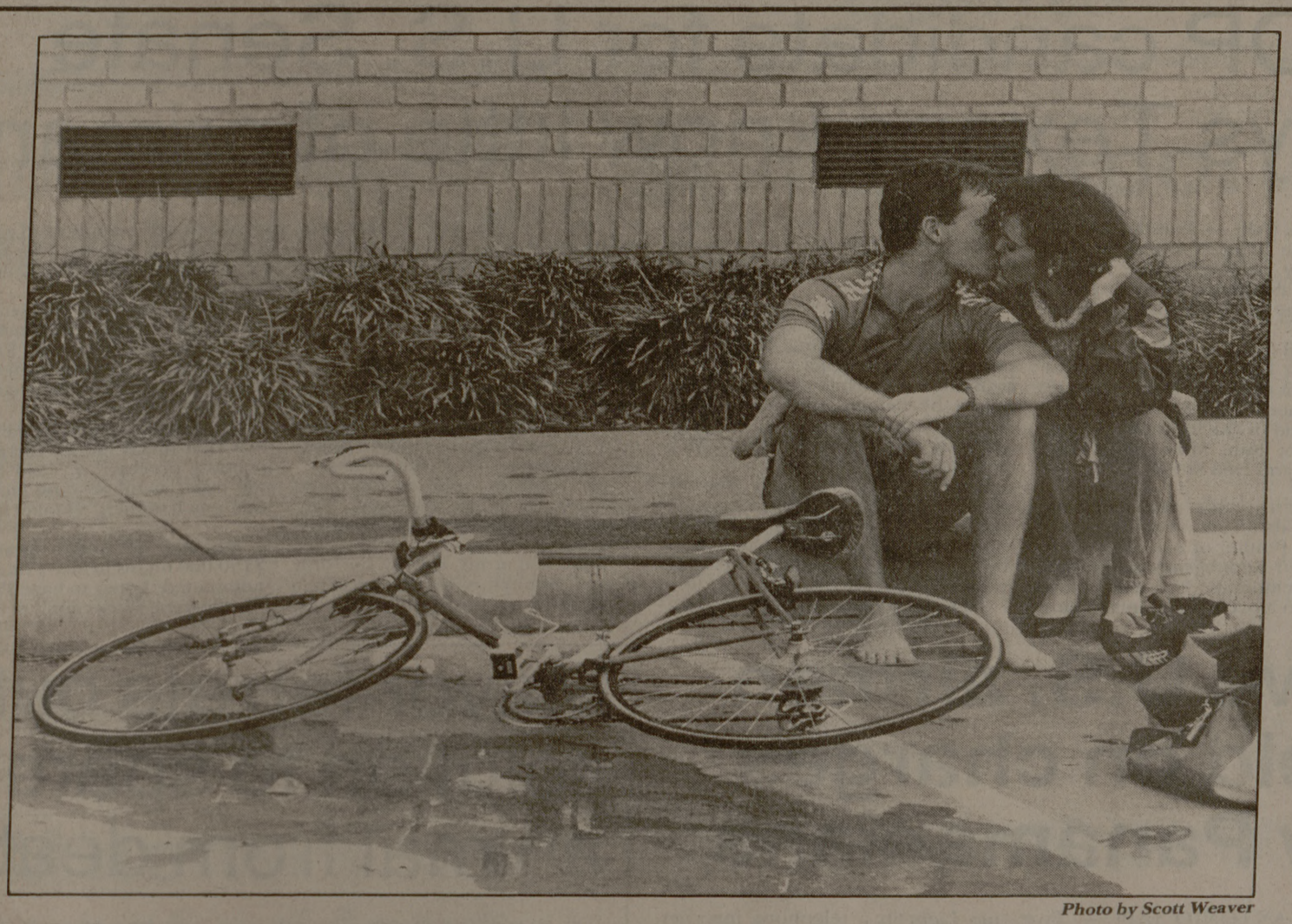
Thursday, March 3, 1988/The Battalion/Page 9