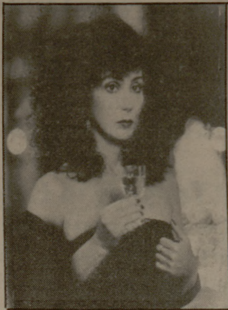
Cher in "Moonstruck"

To add to the confusion, Loretta's fiance returns from Sicily unexpectedly. Everyone involved slowly fills Loretta's kitchen to finally decide who loves who and how much