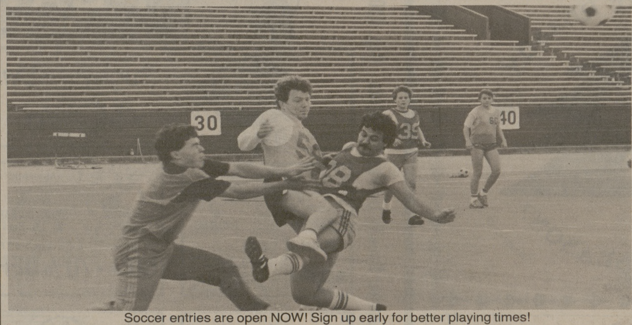
Soccer entries are open NOW! Sign up early for better playing times!