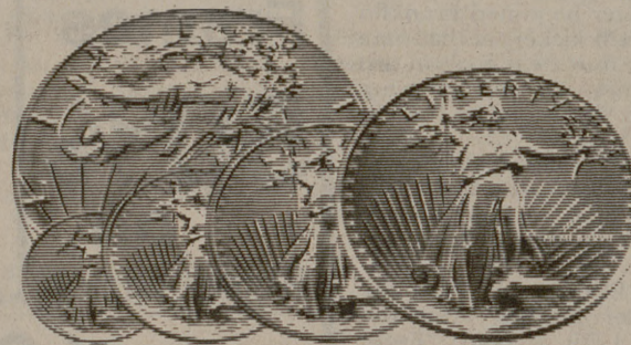
AMERICAN EAGLE GOLD & SILVER BULLION COINS

Large stock of necklace and ring mounts for all popular U.S. and foreign coins.