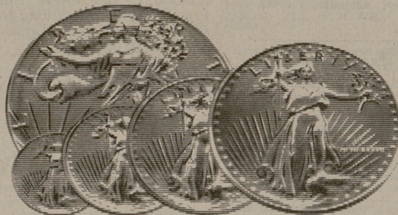
AMERICAN EAGLE GOLD & SILVER BULLION COINS

Large stock of necklace and ring mounts for all popular U.S. and foreign coins.