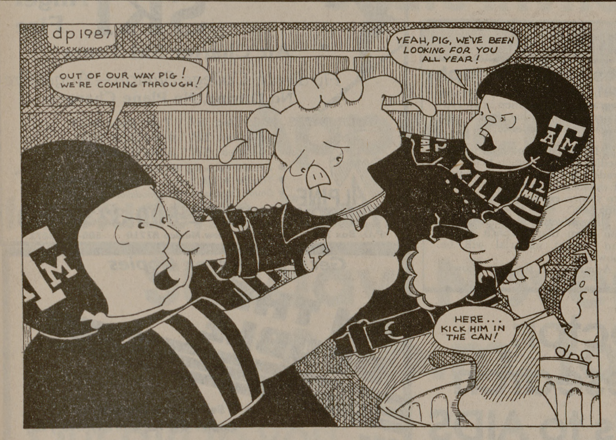
Friday, November 13, 1987/The Battalion/Page 11