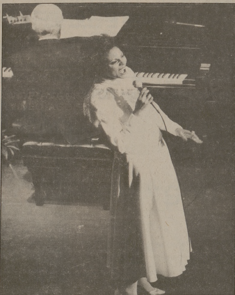
Head Leslie Uggams performs at "The Great Gershwin Concert."