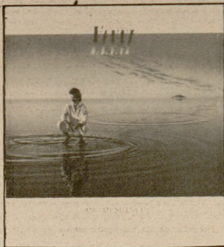
"Out of Silence" Yanni Private Music ***1/2

For the uninitiated, new age is a musical style that combines elements of