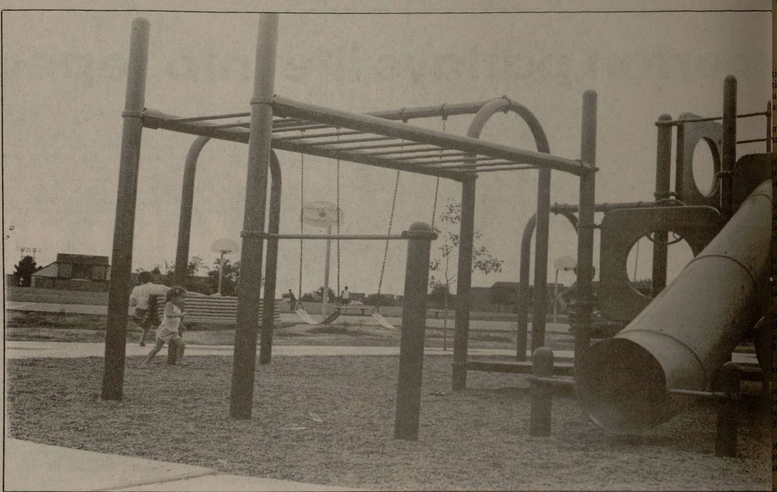
Some children take advantage of the facilities at Anderson Athletic Park in College Station to enjoy a warm afternoon.