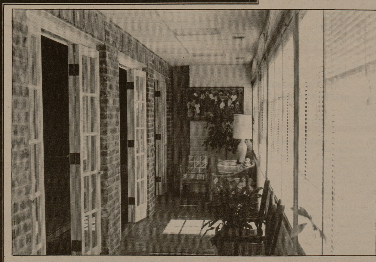
Top: The spacious comfort and relaxed atmosphere of the Vandiver's sun room at the back of the house (a converted breezeway from the kitchen to the garage) is a sharp contrast to the formal living room at the front of the house (above).