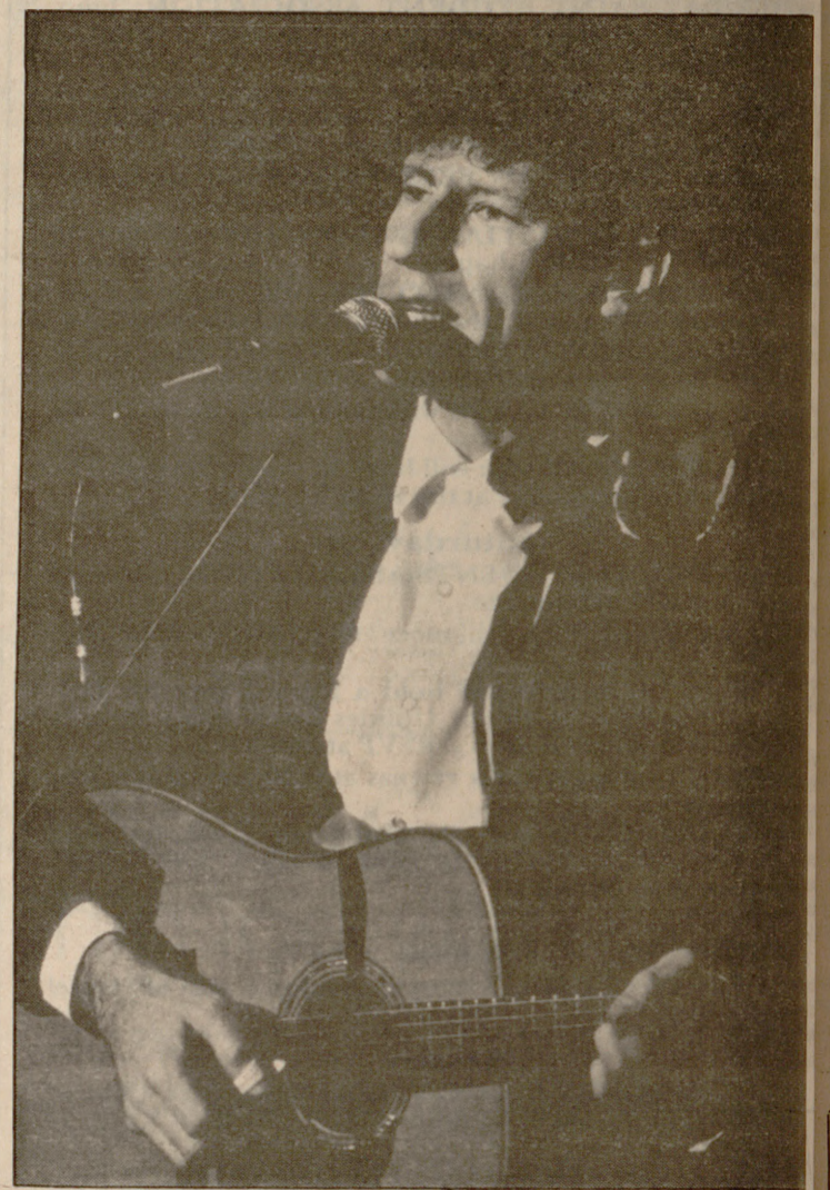
Lyle Lovett entertains the crowd at Rudder Theater Thursday.