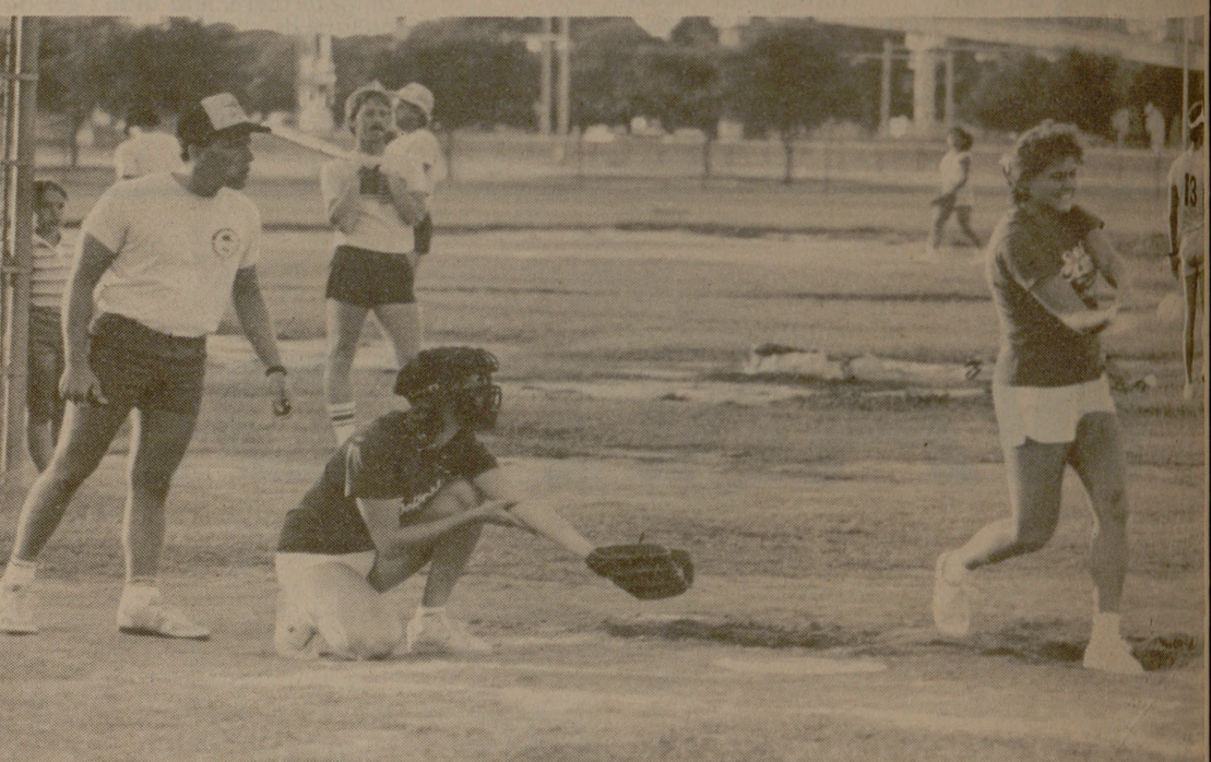
Softball actions winds down this Sunday. Check out the action!