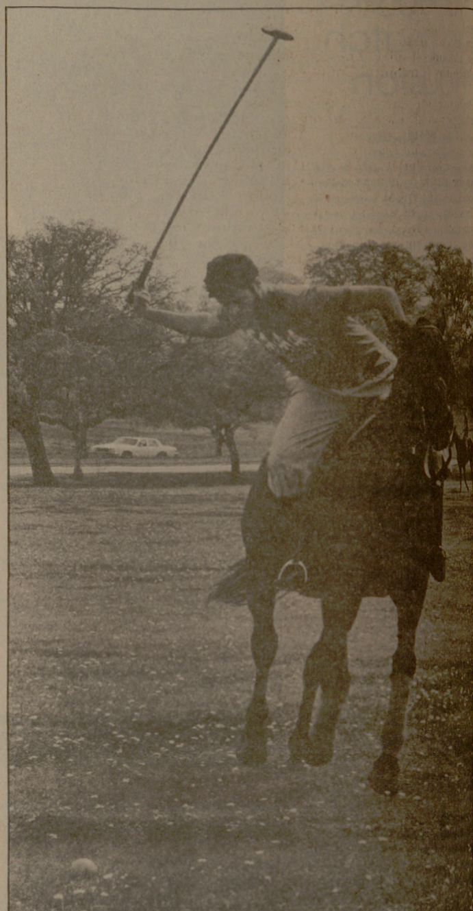
A Texas A&M Polo Club member swings his mallet during practice on the A&M polo field. The club is one of 28 in the nation.

"It takes time, energy and sacrifice. It's a lot of work and little