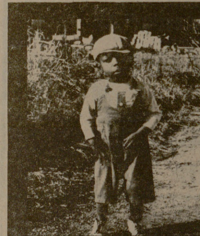
Free Poster 11" x 17"

Can you share a week with the rural poor in Appalachia? The challenges are many... the rewards are few! Volunteering to work with children, elderly and the handicapped can be a memorable experience.