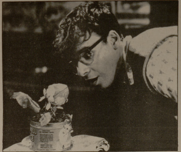
Seymour Krelbourn (Rick Moranis) eyes his unusual plant which has an unusual appetite.

has doubled in size. Business begins to pick up and Seymour becomes anemic trying to supply plant food. One evening Audrey II makes demands for more blood than Seymour can provide. After some arguing and singing, and after Seymour sees that Dr. Scrivello has been beating up on Audrey again, Seymour decides the good dentist would make even better plant food.