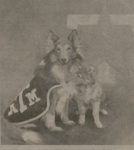
Reveille, Tradition Passed On 950 s/n 16" x 20"

50% Discount On Limited Edition Prints Offer good until January 1, 1987 $75.00 Value - $37.50 with coupon Make check payable to: Texas Traditions P.O. Box 5055 Bryan, Tx. 77805 Coupon .....Coupon .....Coupon