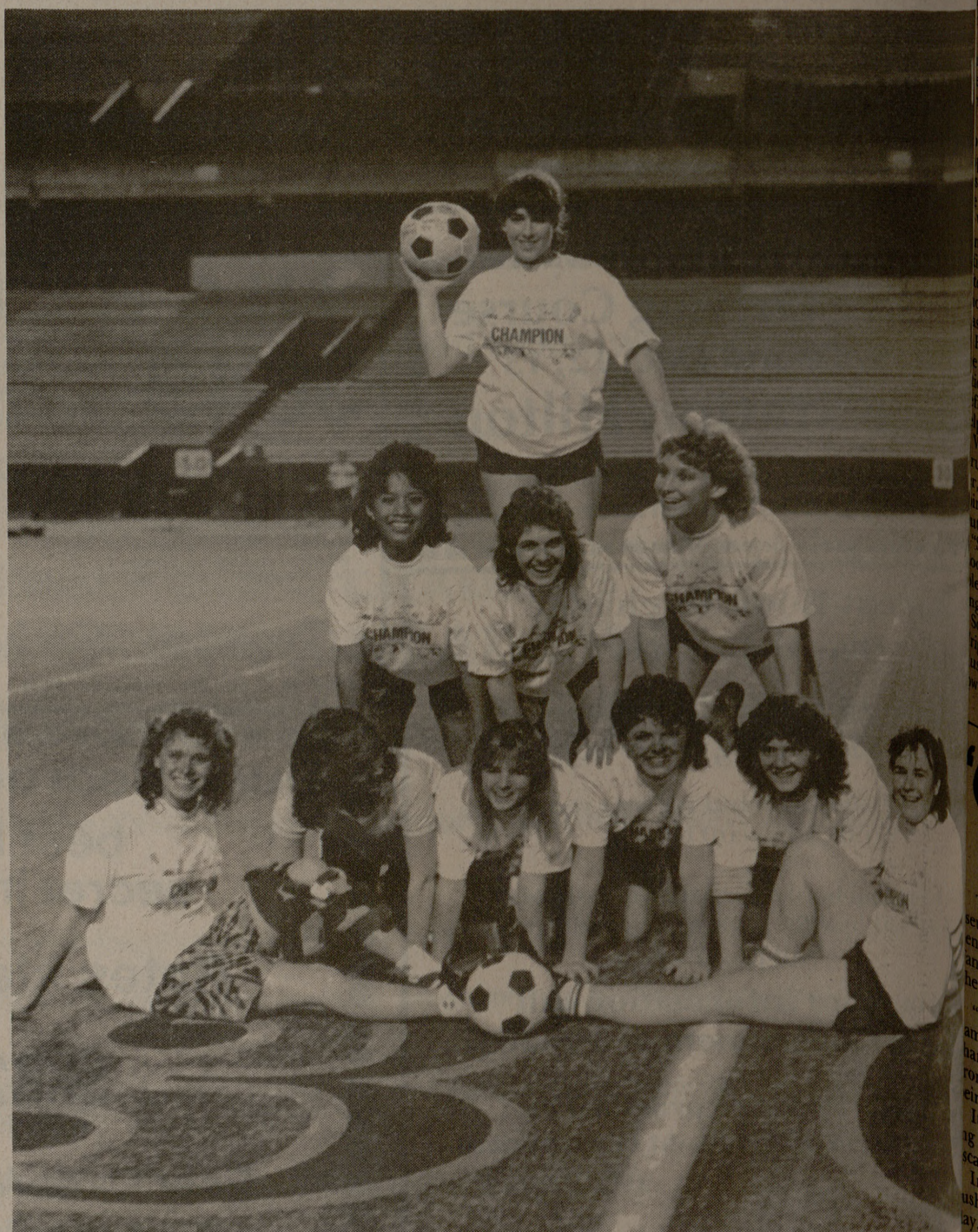
Try to wash out the "Grass Stains" in this year's soccer competition. The "Grass Stains" were last year's Women's Class A Winners.