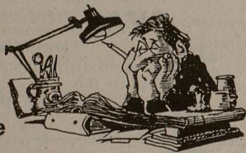
PHOTO SYSTEMS INC.