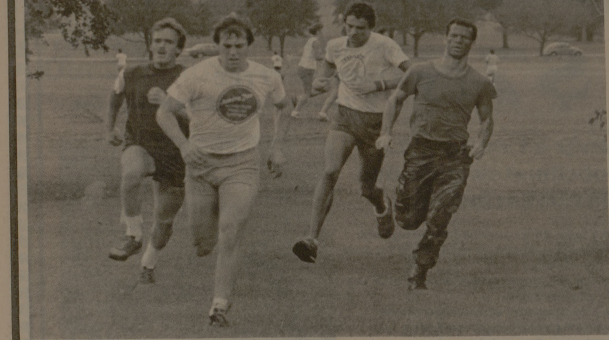
Run On Over and Sign Up For Cross Country!