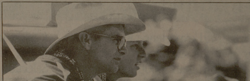
Two convicts waiting to compete "ride" the arena rails and check out the competition.