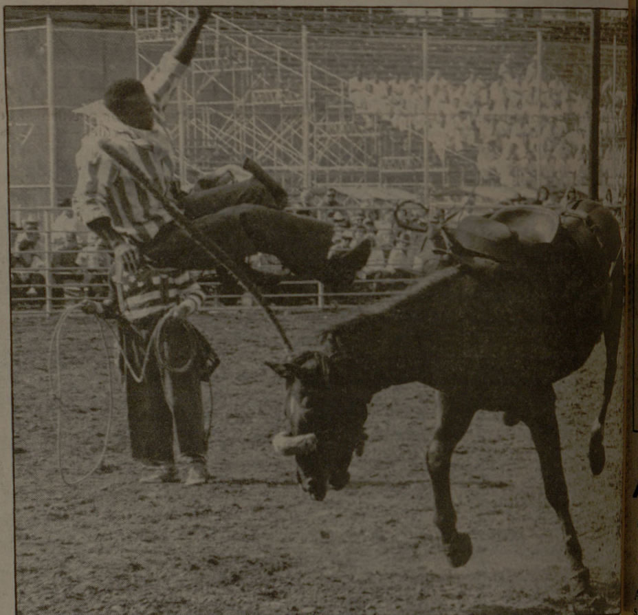
A saddle bronc contestant looks the ground over for a soft place to land after thrown. Only one cowboy managed to stay in the saddle Sunday.