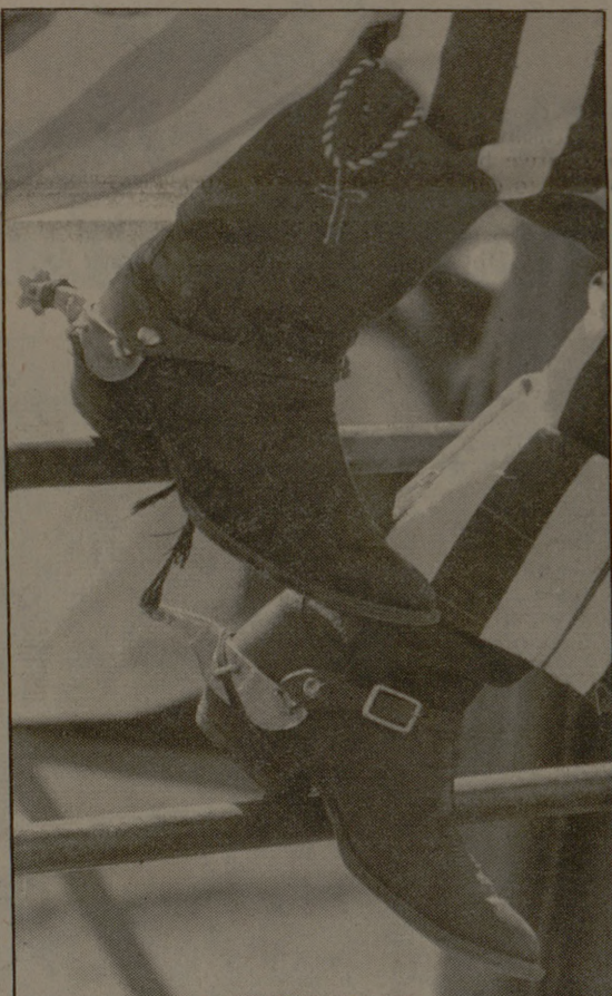
An inmate cowboy carries along a little added insurance for his ride.