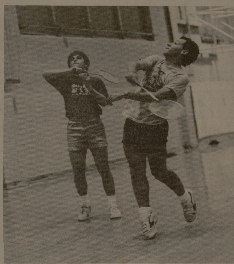
Badminton's not just for the birds! Sign up today.