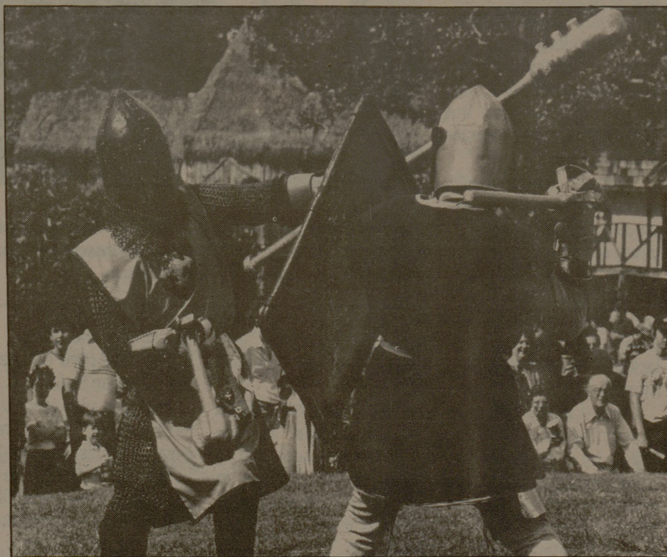
Members of the Society of Creative Anachronisms duel in the sun at the Texas Renaissance Festival. This year's festival will run every weekend from Oct. 4 through Nov. 9.